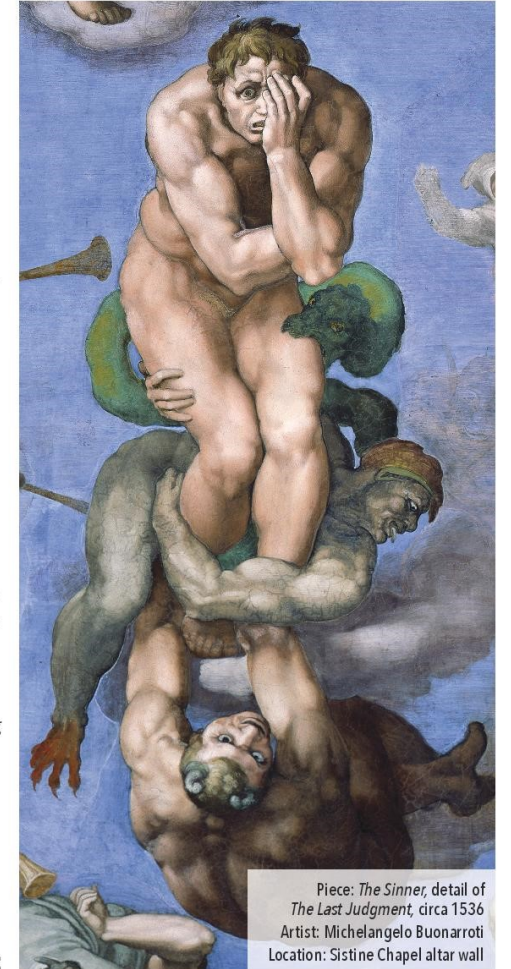
Piece: The Sinner , detail of The Last Judgment , circa 1536 Artist: Michelangelo Buonarroti Location: Sistine Chapel altar wall

"You shall not hate any of your kindred in your heart.... Take no revenge and cherish no grudge against your own people. You shall love your neighbor as yourself" (Leviticus 19:17-18).