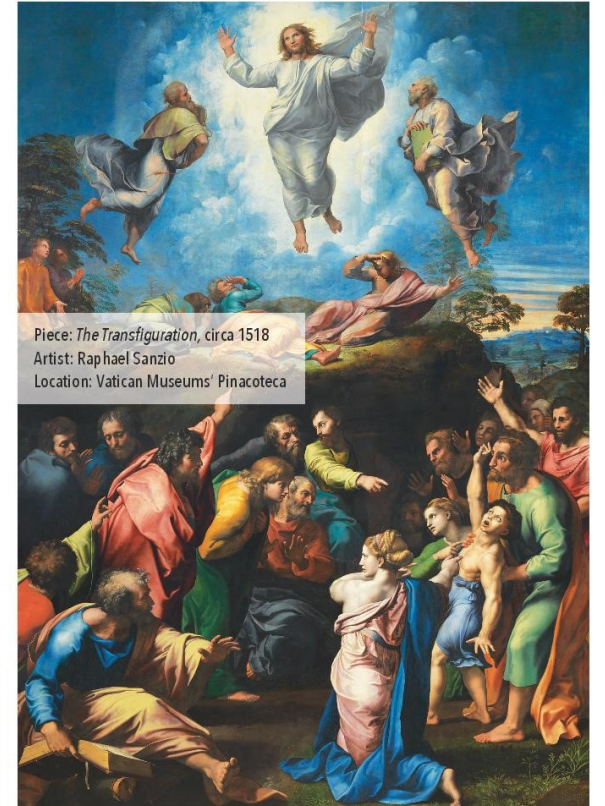
Piece: The Transfiguration , circa 1518 Artist: Raphael Sanzio Location: Vatican Museums' Pinacoteca