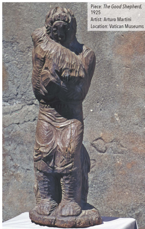
Piece: The Good Shepherd , 1925 Artist: Arturo Martini Location: Vatican Museums