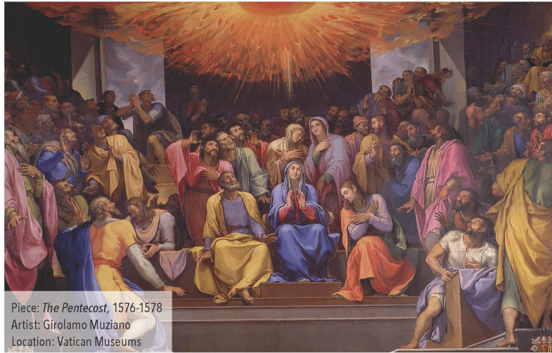
Piece: The Pentecost , 1576-1578 Artist: Girolamo Muziano Location: Vatican Museums