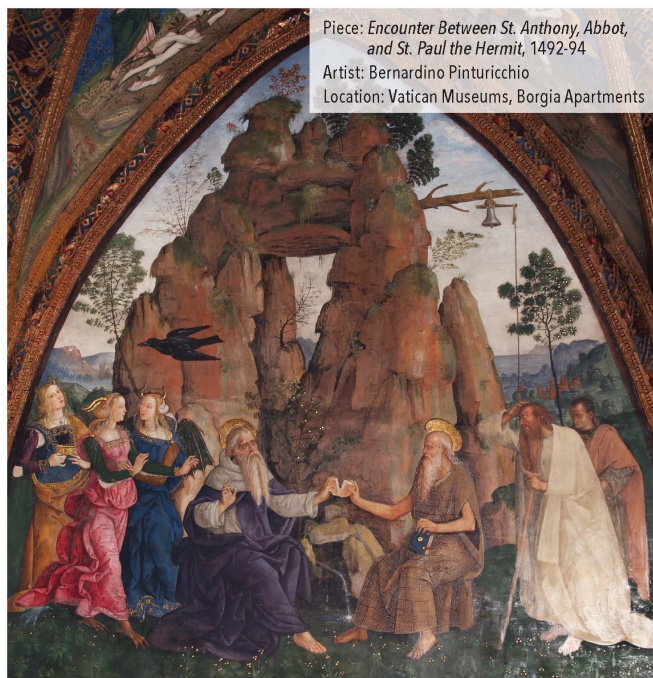
Piece: Encounter Between St. Anthony, Abbot, and St. Paul the Hermit , 1492-94 Artist: Bernardino Pinturicchio Location: Vatican Museums, Borgia Apartments

Religious brothers and sisters living by the vows of poverty, chastity, and obedience—as monks, hermits,