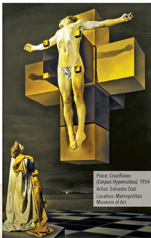
Piece: Crucifixion (Corpus Hypercubus) , 1954 Artist: Salvador Dalí Location: Metropolitan Museum of Art